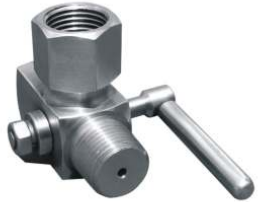
3 way gauge cock