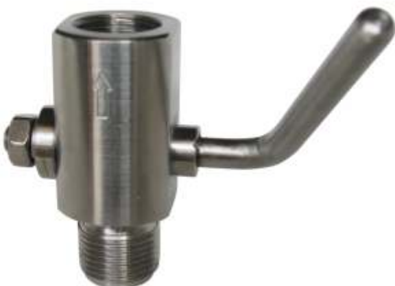
2 way Gauge Cock