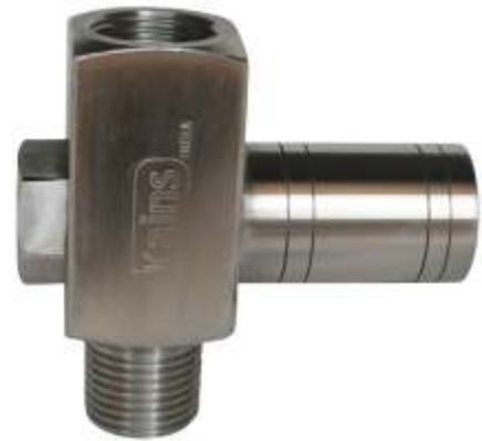
Gauge Saver HP ( over pressure protector)

To protect the pressure Instruments from over pressure