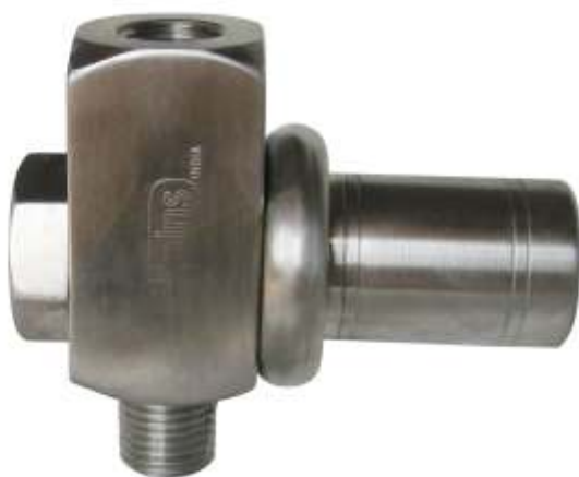
Gauge Saver LP ( over pressure protector)