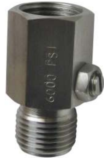
Dampener / Snubber

For low pressure shut- off: for instrument calibration and replacement without interrupting the process.