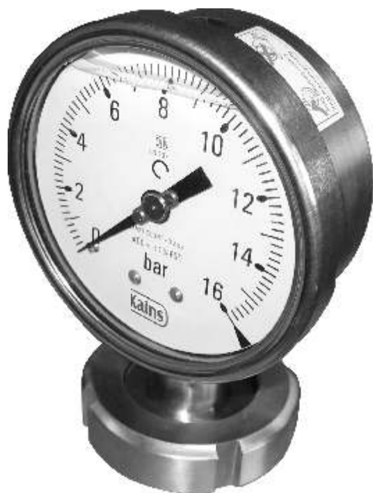
SMS Union Diaphragm Gauge