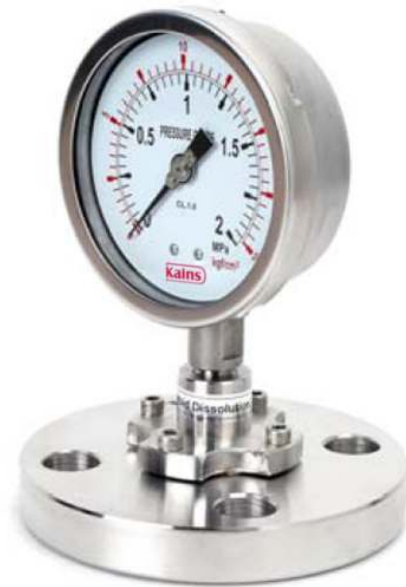
Flanged Diaphragm Pressure Gauge