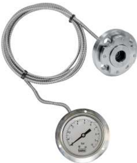
Remote Mounting Pressure Gauge