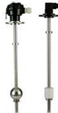
Top Mounting Switches

Available in all SPST & SPDT switch configurations