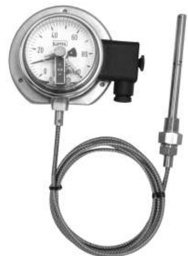
Remote mounting Temperature gauge