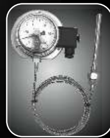
Level & Temperature Instrument