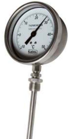
Filled System Temperature gauge