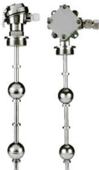
Multi Level Switches