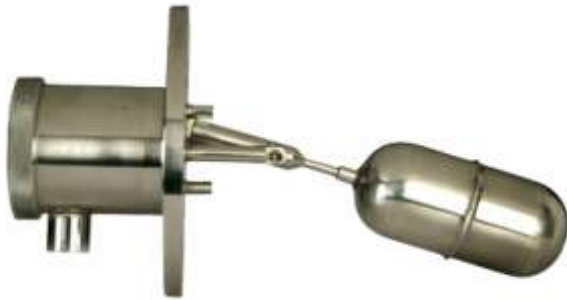
Side Mounting Switches

The series designed for integral mounting through the side of the process vessel are extremely robust and reliable. These are used when the insertion depth of the top mounted model is exceeded or overhead clearance prohibits the use of top mounted switches. Has broad compatibility for a wide range of liquid media in high temperature and pressure conditions.