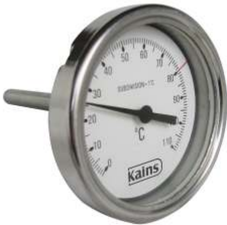
BI metal temperature gauge