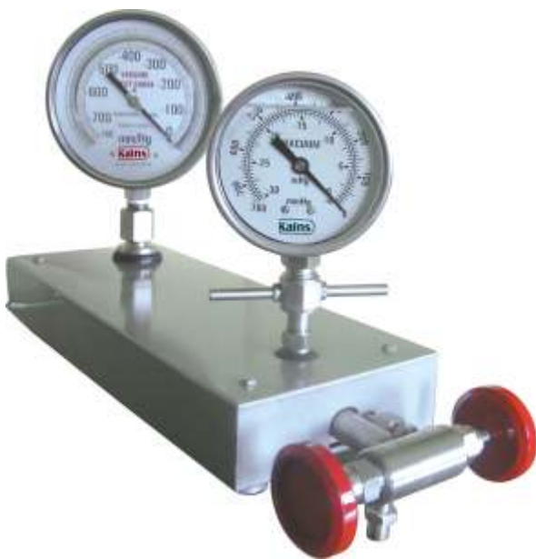
Vacuum Calibration Unit

Vacuum Calibration systems are designed for calibration of electronic or mechanical vacuum instruments in comparison method. In this, instruments are calibrated against a master instrument. Machines are available for a full vacuum of -760 at MSL.