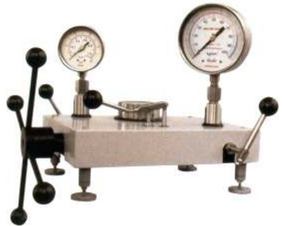
Table Top Calibrator