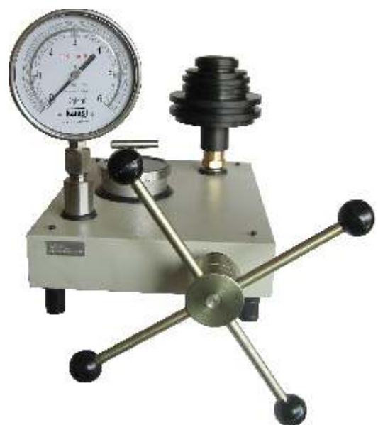
Dead Weight Tester