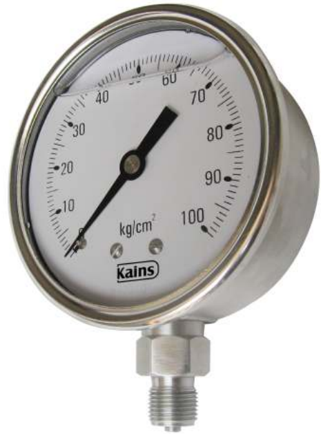
Hydraulic Pressure gauge

Vacuum : available in selected nominal sizes