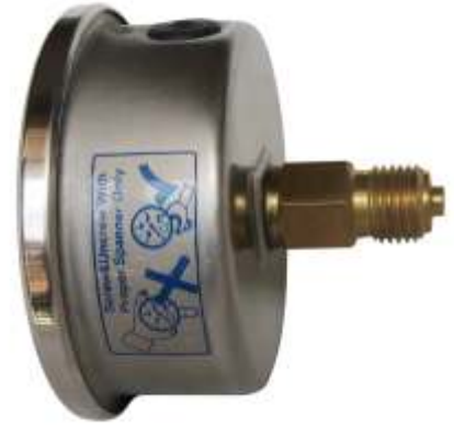
Back Direct Mounting