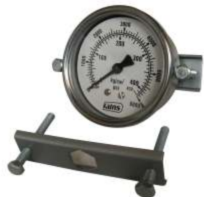
Back Bracket Mounting