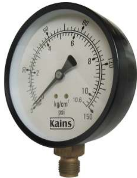
Utility / Commercial – Pressure gauge

S S 304 non weather proof case and bezel