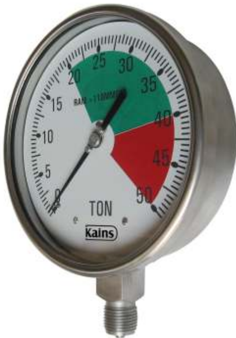
Ton Pressure gauge