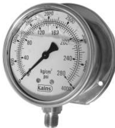
Bottom Surface Mounting