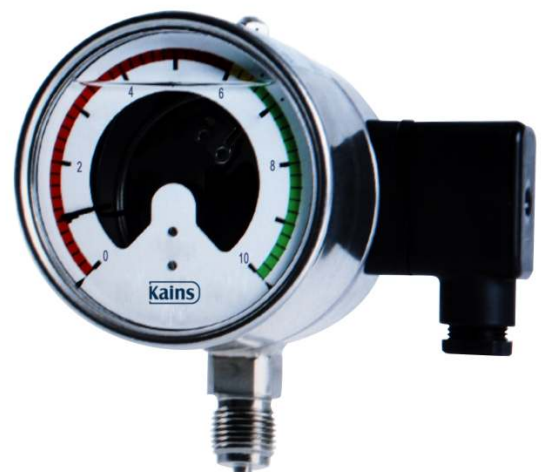
Contact Pressure gauge