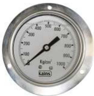
Back Panel Mounting