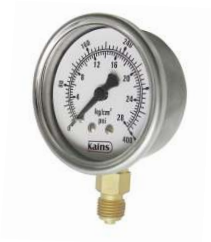
Bottom Direct Mounting