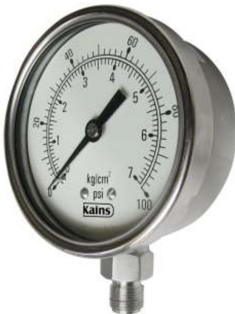
Industrial / Process pressure gauge