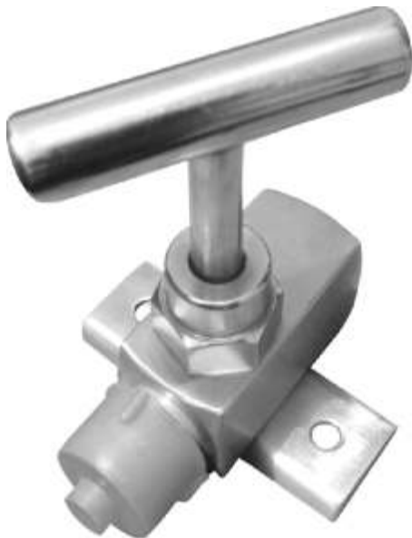
Bracket Mounting Needle valve