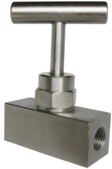
Needle Valve i Series