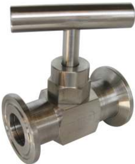
T C end Needle Valve