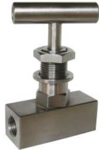
Panel Mounting Needle valves