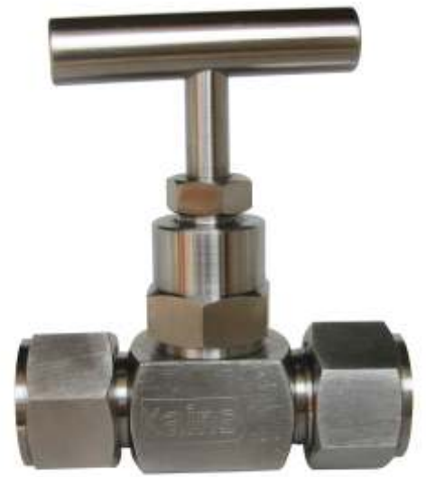
ODT Needle Valve