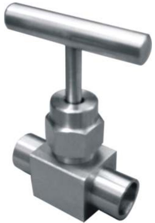
Welded type needle valve