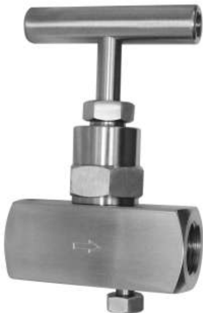
Block and Bleed valve