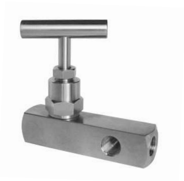
Multi port valve

Other standard threads Customer specification