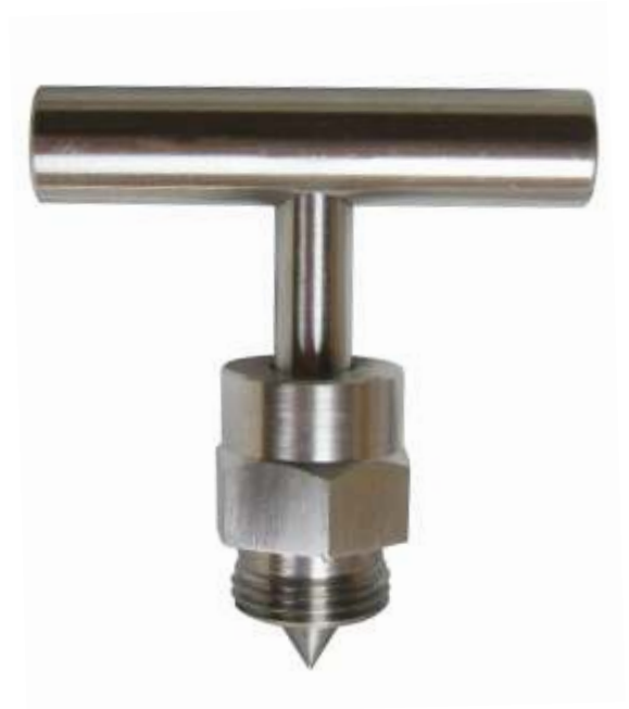
Valve Bonnet I series