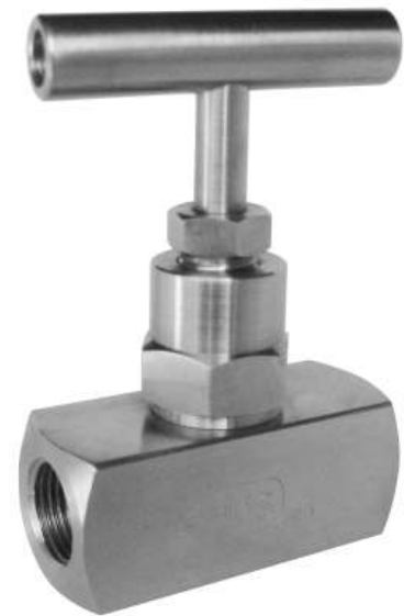
In line Needle valves

Other standard threads Customer specification