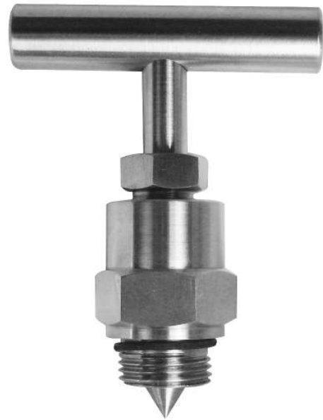
Valve Bonnet K series