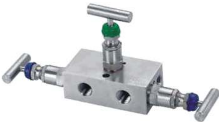
Pipe to Pipe