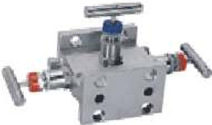
Flange to Flange