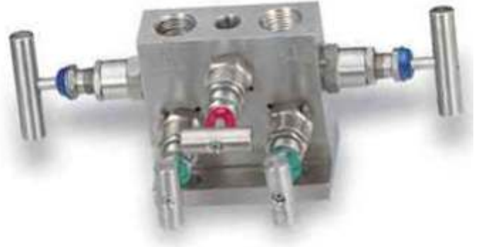
Flange to Pipe