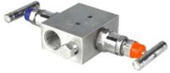
2 Way Manifold