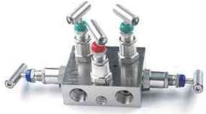
5 valve Manifold