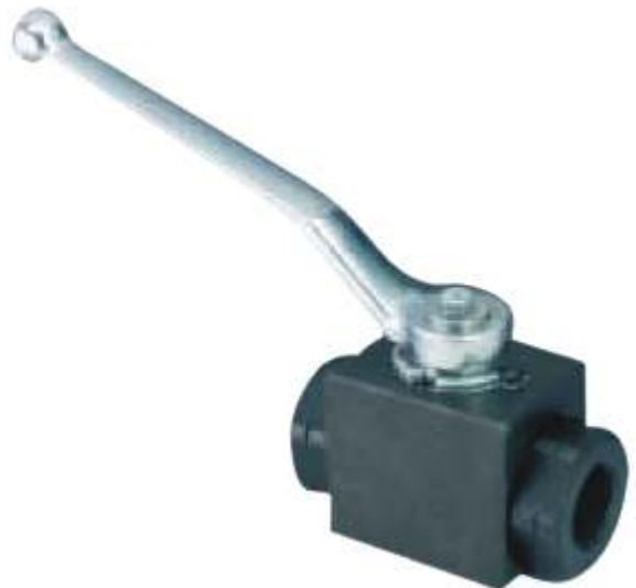
HP Ball Valve Black