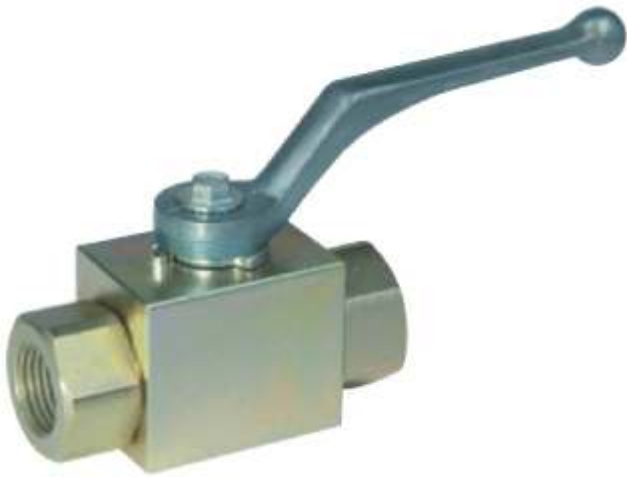
HP Ball Valve