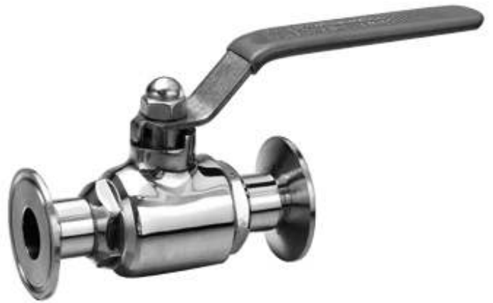
Ball valve with T C End