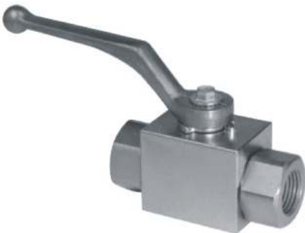
Screwed Ball Valves